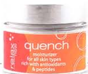
Quench Relax Now moisturizer